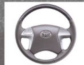
NEW Black Wood Ornament on Steering Wheel with Audio and MID Control