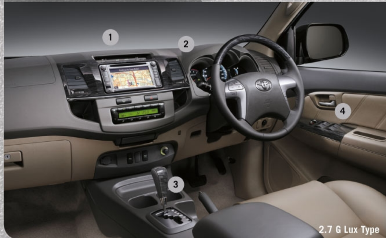
2.7 G Lux Type

Ruang interior yang lapang dan mewah untuk kenyamanan Anda selama di perjalanan. A luxurious, spacious cabin adding a new value of comfort to your journey.