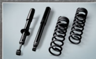
TRD Sportivo Suspension

Fortuner TRD Sportivo is the newest line-up which equipped with Toyota's genuine accessories from Toyota Racing Development (TRD) which will emphasize your character as a conqueror of challenges.