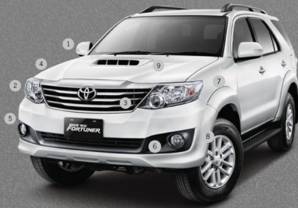
NEW R17 Alloy Wheel with 265/65 Tire