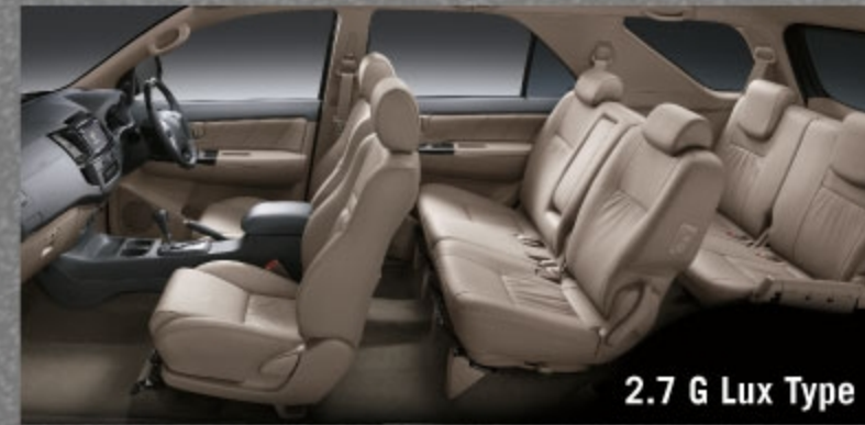
2.7 G Lux Type