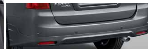
New Back Door Garnish Panel