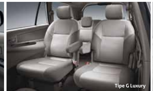
Tipe G Luxury