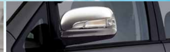
Cover Mirror Painted with Turning Signal Lamp 87910-TA050