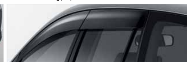
Side Visor (Set) PZ033-0K502-TM