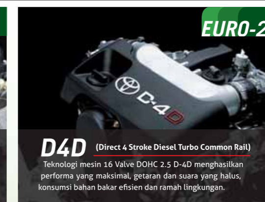
D4D (Direct 4 Stroke Diesel Turbo Common Rail) Teknologi mesin 16 Valve DOHC 2.5 D-4D menghasilkan performa yang maksimal, getaran dan suara yang halus, konsumsi bahan bakar efisien dan ramah lingkungan.