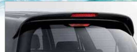
Rear Roof Spoiler (Set)