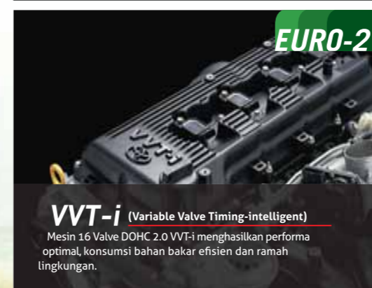
VVT-i (Variable Valve Timing-intelligent) Mesin 16 Valve DOHC 2.0 VVT-i menghasilkan performa optimal, konsumsi bahan bakar efisien dan ramah lingkungan.