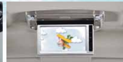
Rear Seat Entertainment