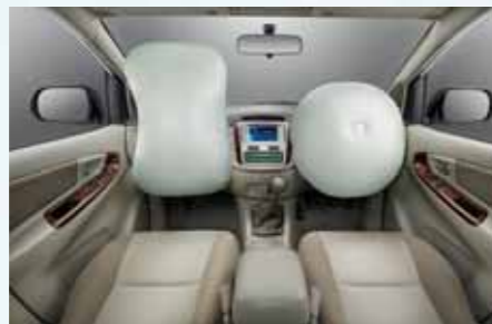
Dual SRS Airbags (Semua Tipe)