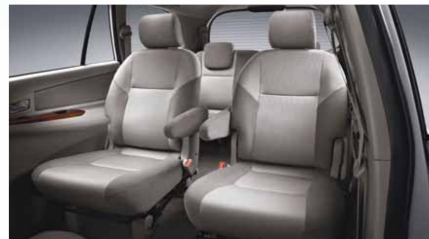
Captain Seat - Tipe G (Set) 71005-TA055