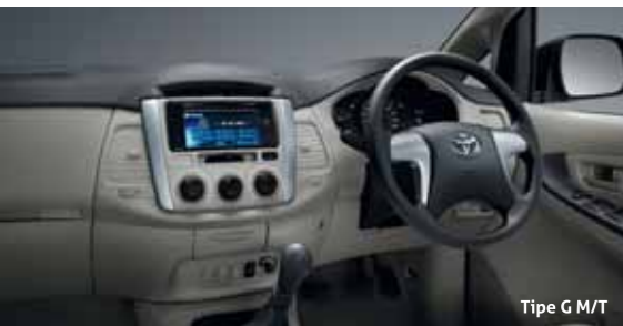
Tipe G M/T