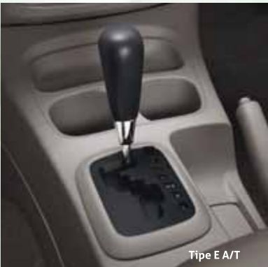
Tipe E A/T