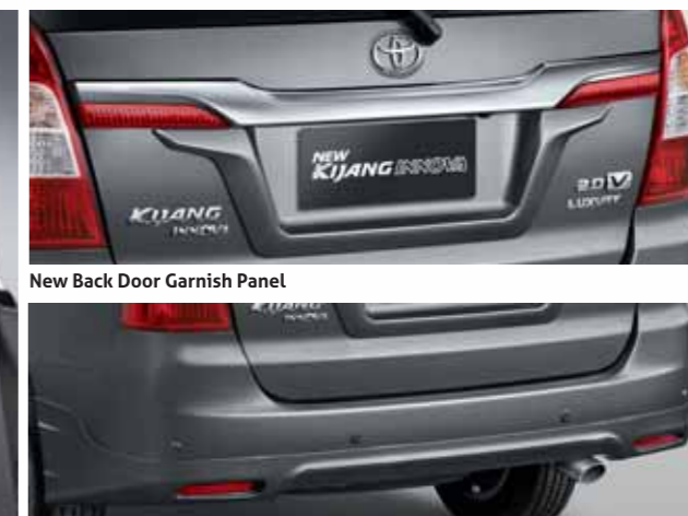
Rear Bumper Spoiler PZ036-0K503-TM