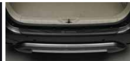
Rear Bumper Step Cover PZ050-0K501