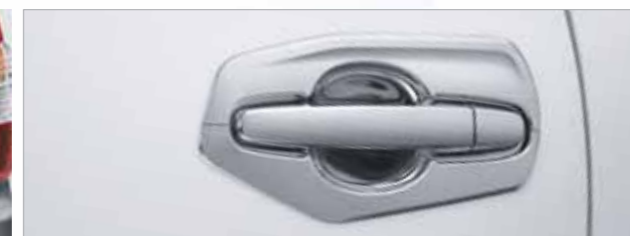
Chrome Door Housing (Set) PZ042-0K505-TM