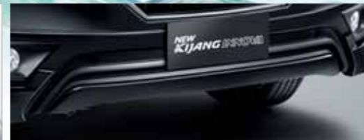
Front Bumper Spoiler (Set)