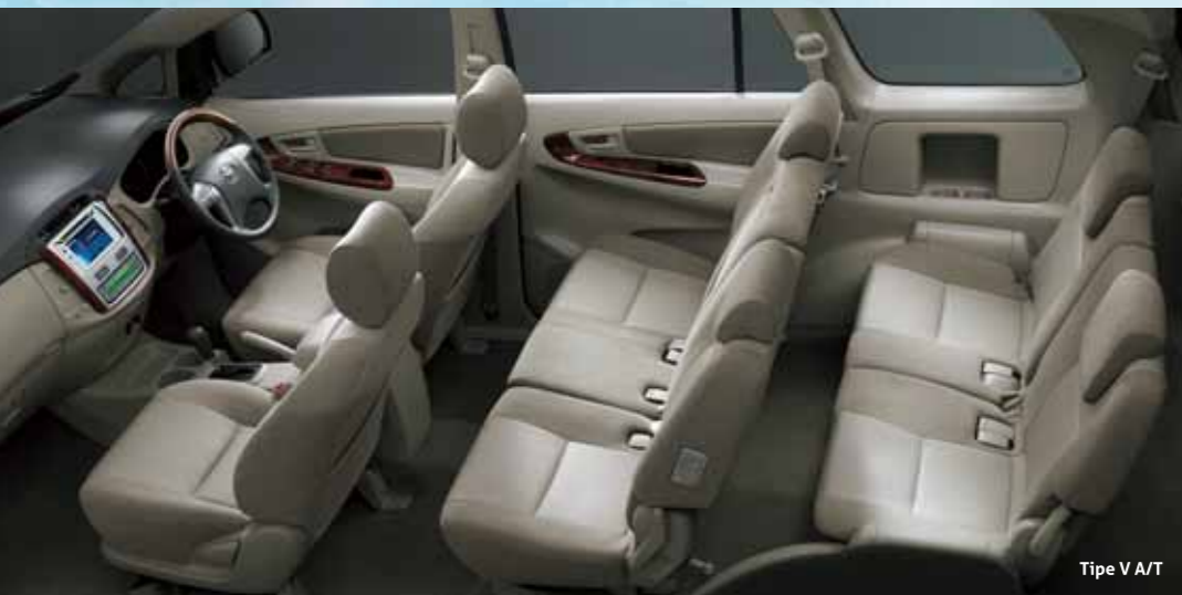
Tipe V A/T