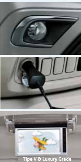
Tipe V & Luxury Grade