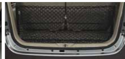
Cargo Net PZ003-0K001