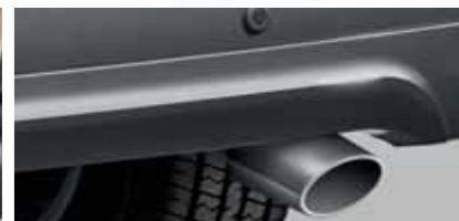
Muffler Cutter PZ056-0K009