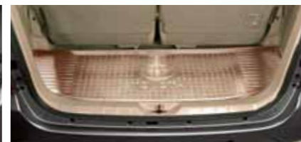
Luggage Tray PZ002-0K501