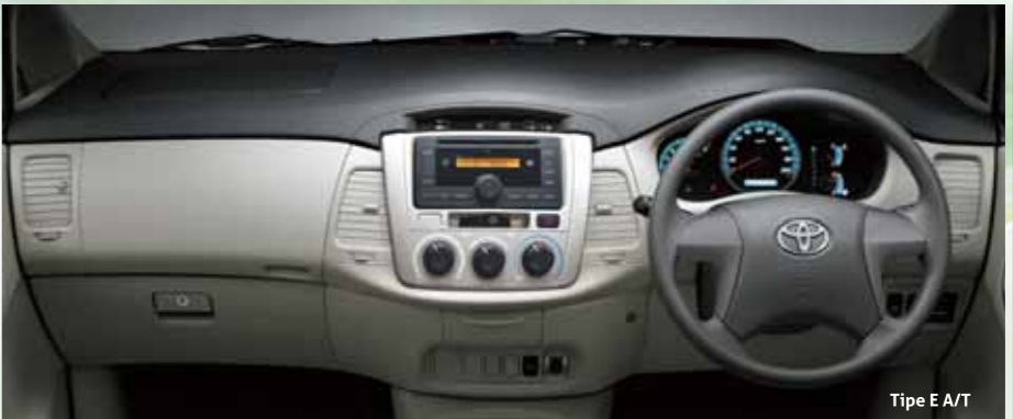
Tipe E A/T