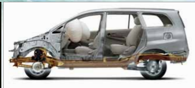
GOA (Global Outstanding Assessment) Body