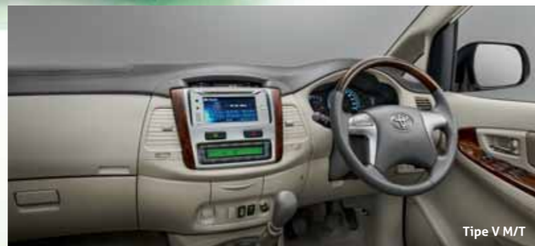
Tipe V M/T